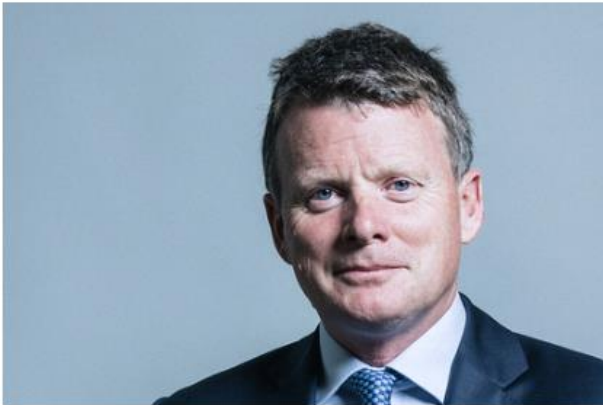
Lord Benyon highlighted the role of food waste collections in reducing carbon emissions

Separate food waste collections are the waste sector's "biggest contributor" towards reducing its emissions, according to Defra minister Lord Benyon.